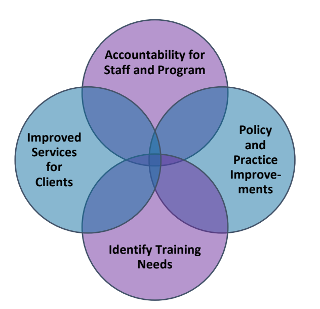
Figure 2 – The Benefits of APS QA

A formal QA process allows APS to hold staff accountable, to appropriately adjust their policies and procedures, to identify training needs and, in the end, to improve services to clients. Figure 2 illustrates that each of these benefits are interconnected. A particular QA review process may identify issues that will impact both training and policy and practice. Each benefit is described below.